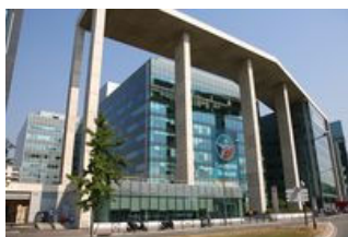
Arcs de Seine